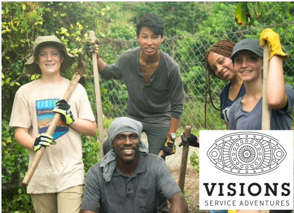
VISIONS students with a community partner in the British Virgin Islands

"VISIONS chooses to support WLI because we believe that building peace and understanding in the world comes from sincerely connecting to other people and cultures. With that, we also believe that connecting to other cultures is facilitated by learning new languages and developing a curiosity about the world."